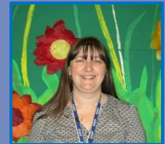
Miss Mills Nursery Nurse